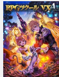
2011 Steam Version Released